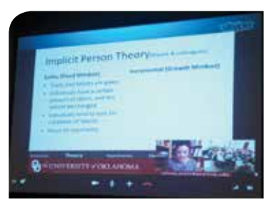
Technology allowed for a Skype presentation at the OCMC in a Lincoln Hall lecture hall.

advanced data visualization, and machine-learning methods.